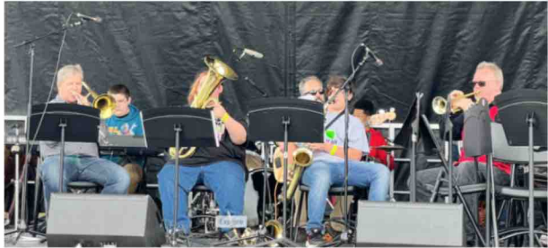
CJO musicians and students of CMSD's Ben Franklin Middle School at CMSD "Rock Your World with STEAM Family Festival"; Rock & Roll Hall of Fame; Spring 2023

Moreover, this program serves these students at THEIR schools and is part of their daily program, rather than offsite and after school, allowing for maximum participation and inspiration.